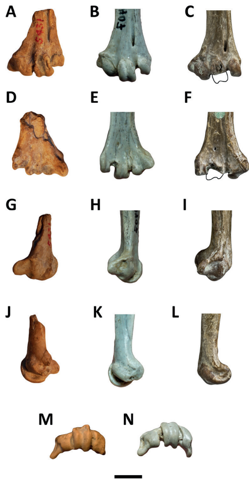
Figure 2 - Comparison between different Thegornis species. Tarsometatarsus in A-C , anterior; D-F , posterior; G-I , medial; J-L , lateral; and M-N , distal views. A,D,G,J,M , Thegornis sosae nov. sp. (MACN PV 5431, holotype), distal end of left tarsometatarsus; B,E,H,K,N , Thegornis spivacowi (MACN-SC 1407, holotype), distal end of right tarsometatarsus (reversed); C,F,I,L , Thegornis musculosus (BMNH A-600, holotype), distal end of right tarsometatarsus with incomplete III trochlea (reversed). Scale bar. A,C,D,F,G,I,J,L-N , 1 cm; B,E,H,K,M , 5 mm.

The articular surface of trochlea IV is relatively transversely wide and is quadrangular in contour. The posterolateral wing is lateroposteriorly oriented, and lacks the sigmoidal contour diagnostic of T. spivacowi (Agnolín, 2022).